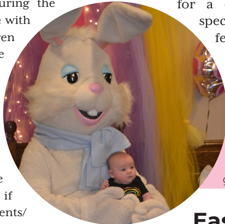
The Easter Bunny enthalls a young visitor at a previous Breakfast with the Bunny event at First Church, as their parents get an Easter snapshot and keepsake.

New volunteers Faith Guides are always welcome to help with Sunday morning Children Faith Adventures at both our 9am and 11am services. No prior experience is necessary. If you are interested or would like more information, contact Bobby: bobby.burtt@akronfcc.org or 330.780.8122 (call/text), 330.253.5109 x101 (office).