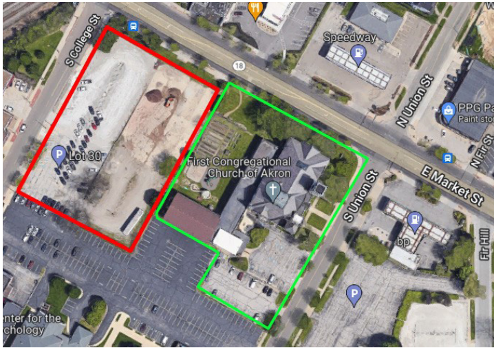
Aerial view with the property in question outlined in red. First Church's existing property, on this side of Union Street, is outlined in green.