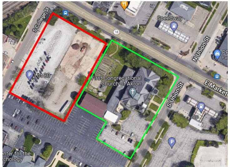
Aerial view with the property in question outlined in red. First Church's existing property, on this side of Union Street, is outlined in green.

First Church became aware in early December that the University of Akron has put the property abutting our garden on the market. The Governing Board convened at a special meeting on December 13, 2022, and voted unanimously to secure a commercial real estate agent to investigate and possibly help First Church negotiate making a bid. The possibility of purchasing the property would secure First Church's future and options, including the access we currently have had to our property and garden.