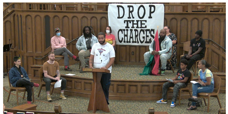
Above: Press conferences took place on September 6 & 22 in the First Church Meetinghouse.