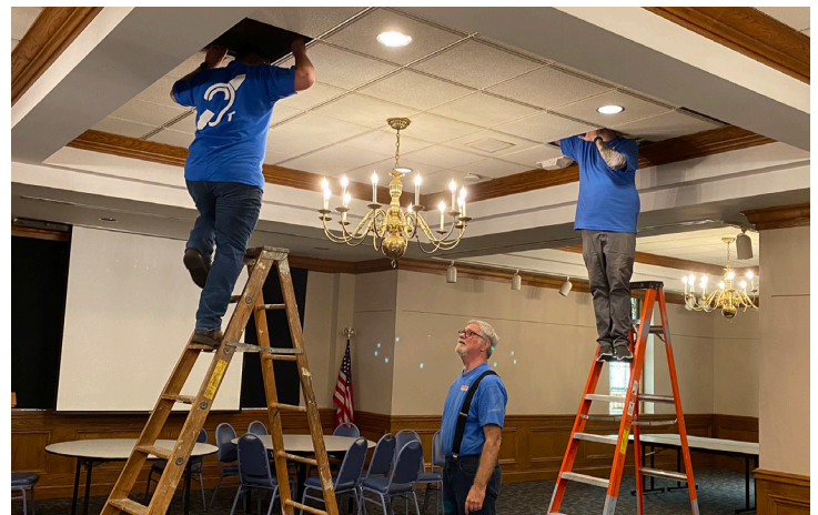
Below: Brown Audio Service, LLC installs the hearing loop for the Upper Room via the Fellowship Hall ceiling.